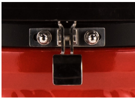
Stainless Steel Latch