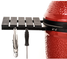
Aluminum Side Shelves