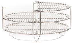
Divide & Conquer® System