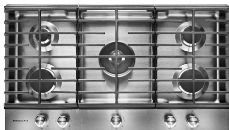
Stainless Steel KCGS556ESS