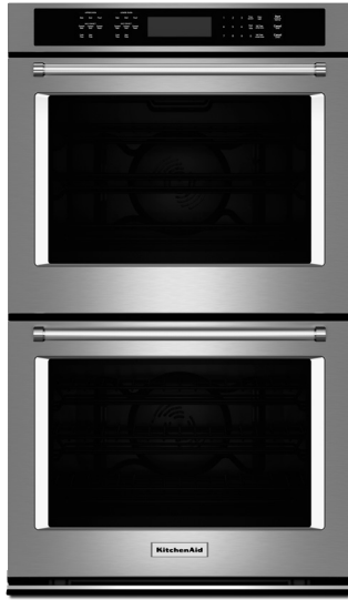
Stainless Steel KODE507ESS