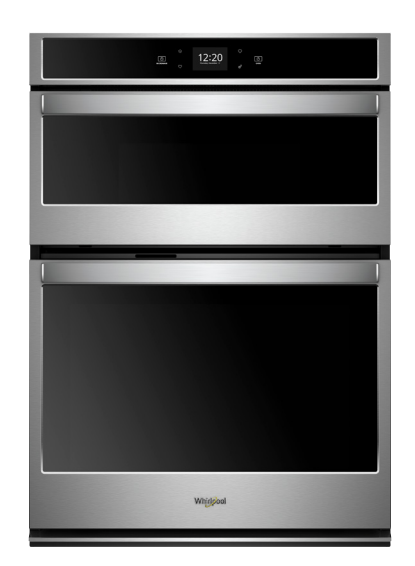
Stainless Steel WOC54EC0HS