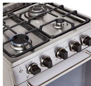
Modern knobs designed for cooktop & oven