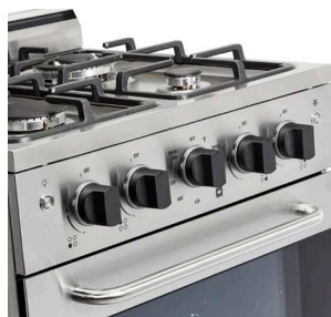
Modern knobs designed for cooktop & oven