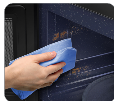
Ceramic Enamel Interior