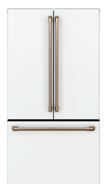
ALSO AVAILABLE IN