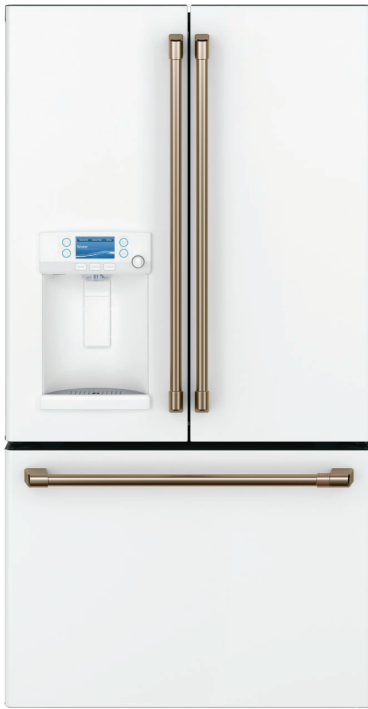
CYE22TP4MW2 Matte White with Brushed Bronze handles