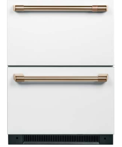
CDE06RP4NW2 Matte White with Brushed Bronze handles