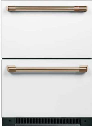
CDE06RP4NW2 Matte White with Brushed Bronze handles