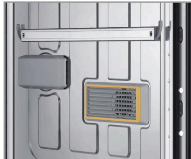
Smart Dry with AutoRelease™ Door

Fingerprint Resistant Black Stainless Steel