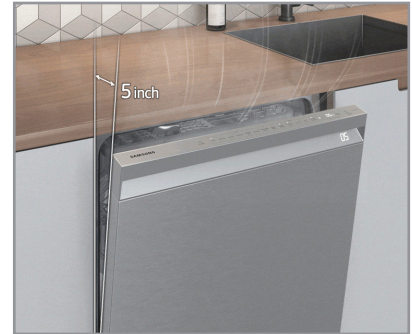
AutoRelease™ Door Dry