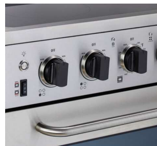
Modern knobs designed for easy use