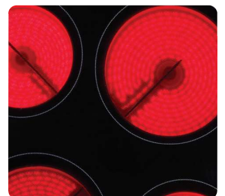
Glass Top Elements