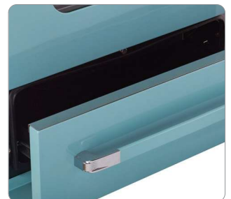
Zinc Cast Handles