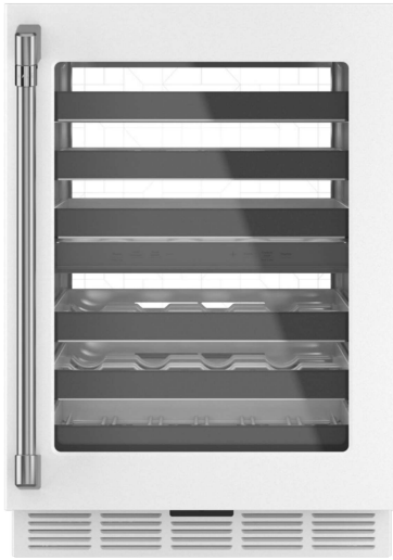
CCP06DP4PW2 Matte White with Brushed Bronze handles