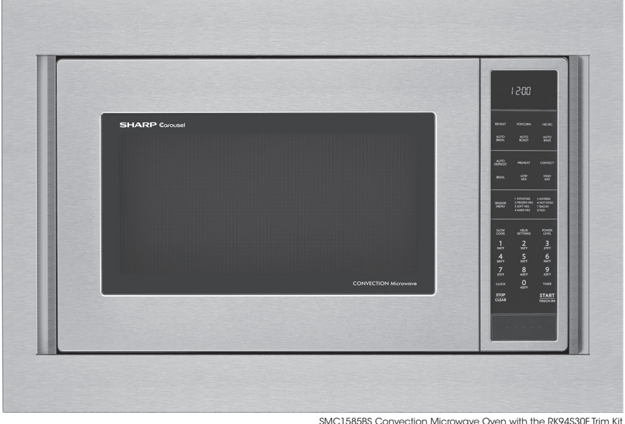
SMC1585BS Convection Microwave Oven with the RK94S30F Trim Kit

With innovative features like Auto Broil, Auto Roast, Auto Bake, Auto Defrost and the Carousel® turntable system, reheating your favourite foods, snacks and beverages is easy. With decades of experience designing smart, innovative microwaves, it's easy to see why cooks throughout the world trust Sharp Carousel.