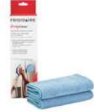
10FFMICF01 ReadyClean™ Microfiber Cleaning Cloths 10FFMICF01 ReadyClean™ Microfiber Cleaning Cloths