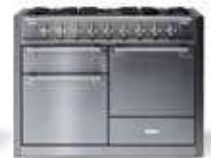
STAINLESS STEEL (SS)