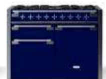
MIDNIGHT SKY (SKY)