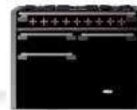
MATTE BLACK (MBL)