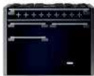
GLOSS BLACK (BLK)