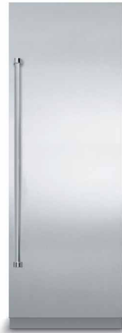
Shown with optional stainless steel door panel kit