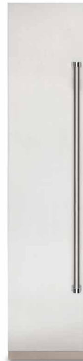
Shown with optional stainless steel door panel kit