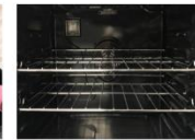
Steam Cleaning Oven