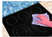
Spill Proof Cooking Surface