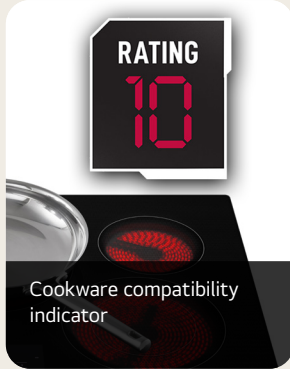
Cookware compatibility indicator