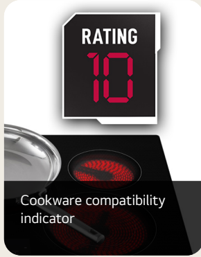
Cookware compatibility indicator