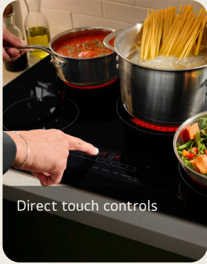
Direct touch controls