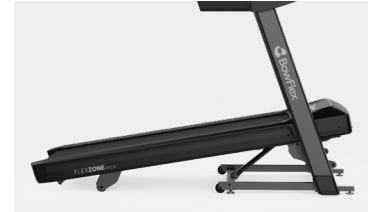
Up to 15% motorized incline