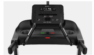
Dual LED/LCD windows