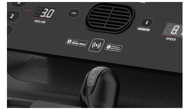
Connect to Apple Watch® and Galaxy Watch